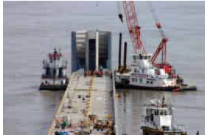
Figure 8 – Final Installation of the Floating Approach Wall

Corps of Engineers, and INCA Engineers provided the flexibility needed to successfully overcome unforeseen soil conditions on the project. Figure 8 shows final installation floating approach wall structures.