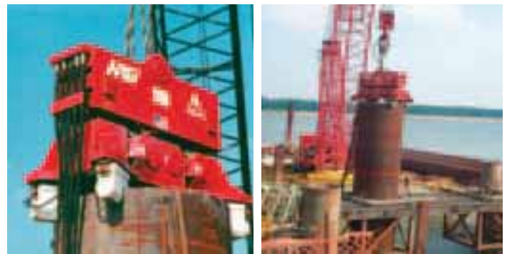
Figure 4 – HPSI 2000 Vibratory Hammer

The casings were driven into the substrata using a HPSI 2000 vibratory hammer with a rated eccentric moment of 21,445 in-lbs (2,423 Nm) (see Figure 4). This hammer, the largest of its kind, was designed and built specifically for the project by Hydraulic Power Systems, Inc. In order to obtain optimal hammer performance, the operating frequency and amplitude of the hammer was varied during driving.