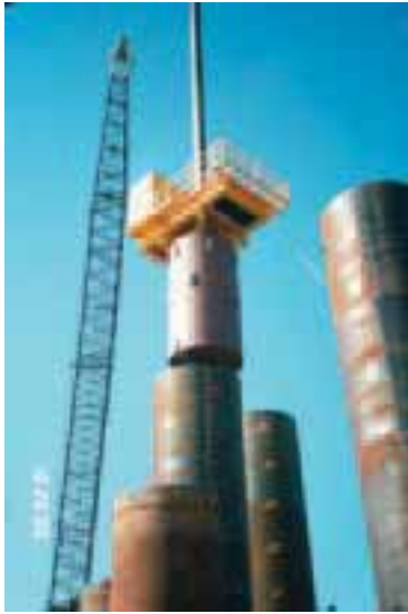
Figure 5 – Steven M. Hain Drill with 18-ft bucket

However, casing refusal above the final tip elevation (near the top of the Fort Payne formation) was encountered during driving the casings for the downstream riverside nose pier. Several attempts were made to advance the shafts including using the more powerful (26,000 in-lb. or 2,938 Nm) tandem King Kong APE Vibratory Hammer. See Figure 6. The skin friction on the casing had “set-up” from the time initial driving halted until cleanout occurred. This made it impossible to advance the casings even after 6 feet (1.8m) of material was drilled out below the tips.