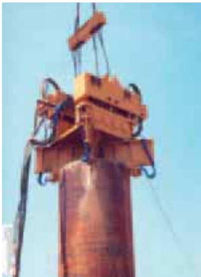
Figure 6 – APE Tandem King Kong Hammer

However, casing refusal above the final tip elevation (near the top of the Fort Payne formation) was encountered during driving the casings for the downstream riverside nose pier. Several attempts were made to advance the shafts including using the more powerful (26,000 in-lb. or 2,938 Nm) tandem King Kong APE Vibratory Hammer. See Figure 6. The skin friction on the casing had “set-up” from the time initial driving halted until cleanout occurred. This made it impossible to advance the casings even after 6 feet (1.8m) of material was drilled out below the tips.