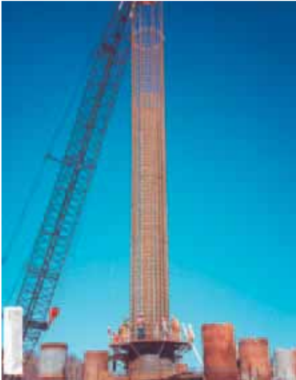
Figure 7 – Typical Reinforcing Steel Cage

concrete temperature, and volume discharged. The duration of concrete placements varied, but generally took about 10 hours per shaft.