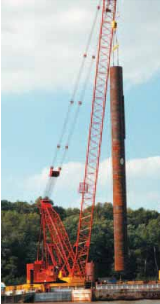
Figure 3 – Typical Shaft Casing

In order to eliminate delays due to casing field splices, and radiographic weld testing, the casings (Figure 3) were delivered to the site full length. Eaton Metal Products fabricated the casings, weighing up to 130 tons, at their facility in Pocatello, ID, and transported them via rail to Memphis, TN, where they were transferred to hopper barges and towed to the site.