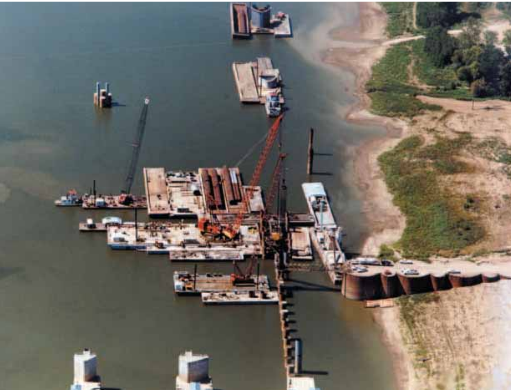
Aerial View - Olmsted Approach Walls Project, Olmsted, IL